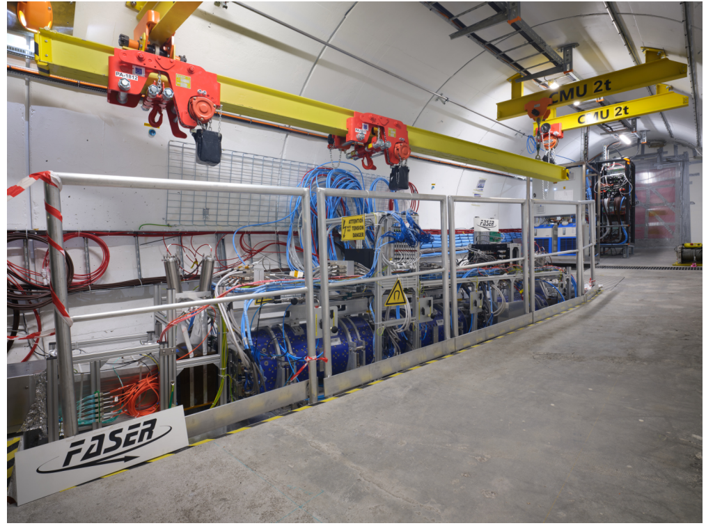
The FASER detector installed 480 m away from the ATLAS detector collision point, in the LHC side tunnel TI12.

4 APRIL, 2024 | By Piotr Traczyk (/authors/piotr-traczyk)